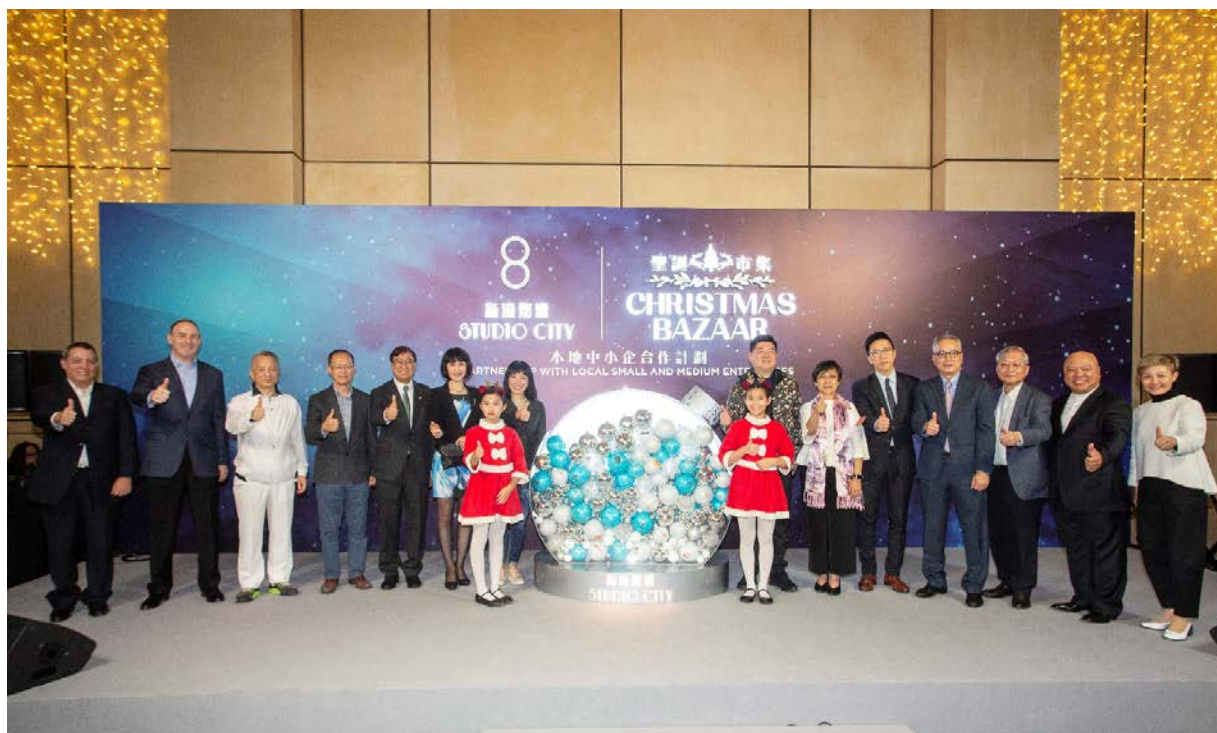
Melco executives and guests of honor officiate the Studio City Christmas Bazaar opening.